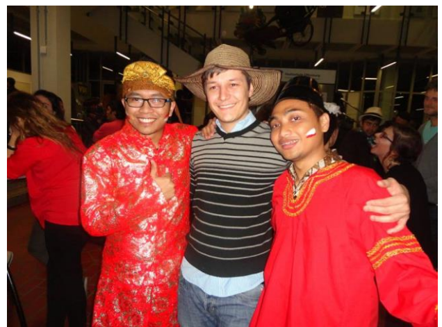
Students enjoying themselves after successful presentations