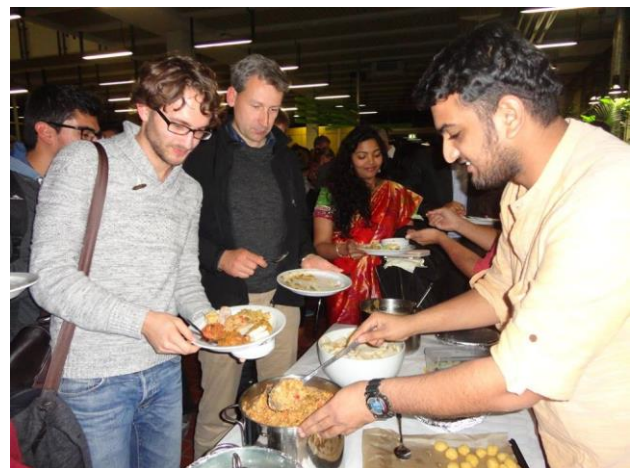
Guests and students sharing meals