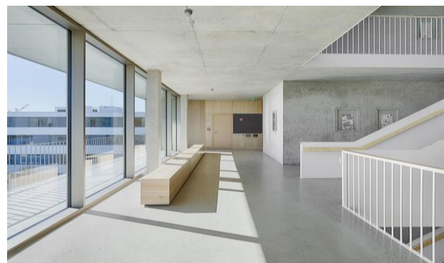
Insides of E-Building 2014

As you've been reading about for the last two years, Offenburg University together with the local community and the Baden-Württemberg Finance Ministry have been investing in the institution's growth and modernization, to the benefit of students and staff.