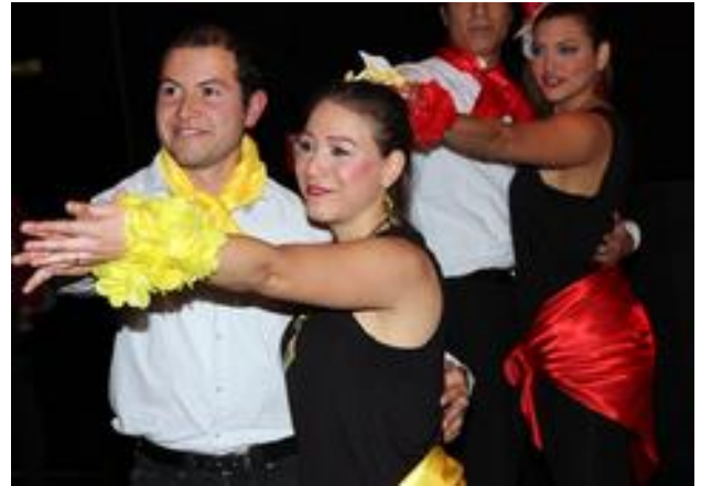
Students from Venezuela and Colombia performing a traditional dance together

More than 400 guests saw presentations from 14 countries and tasted delicacies prepared by international students.