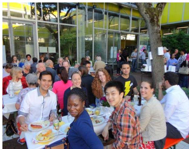
Alumni and members of the Senior Service at the 50th Anniversary of the University

About 180 people attended the Alumni Evening, when alumni, staff, current students of the Graduate School as well as Senior Service members came together for student performances, food, drinks and dance.