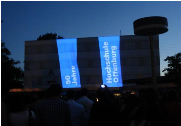
Project Mapping onto Building A

All day long, attendees enjoyed a festival with many interesting exhibitions, live experiments, and insights into the history of the University.