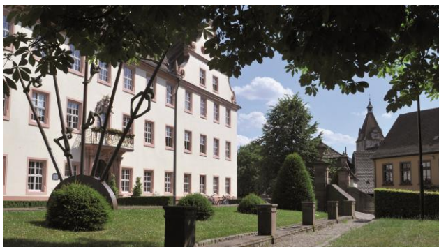
Offenburg University building in Gengenbach

We just received notice that IBC has been ranked by QS (Quacquarelli Symonds, one of the three most influential university rankings in the world, which also runs a number of well-known MBA-related events), in the category of "Emerging Regional" programs.