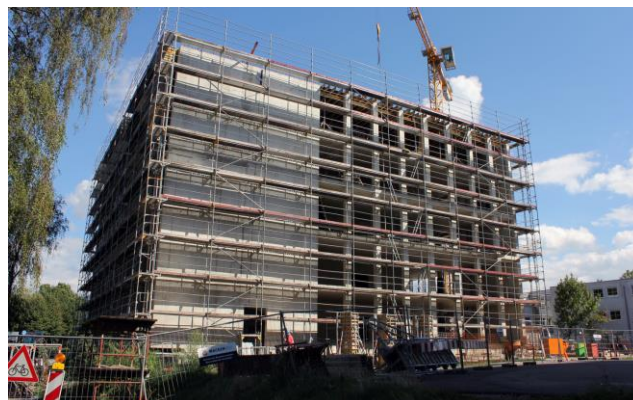
The new building in September 2013

In only one year, the Departments of Mechanical Engineering and Electrical Engineering and Information Technology will move into this new 2500 square-meter building.